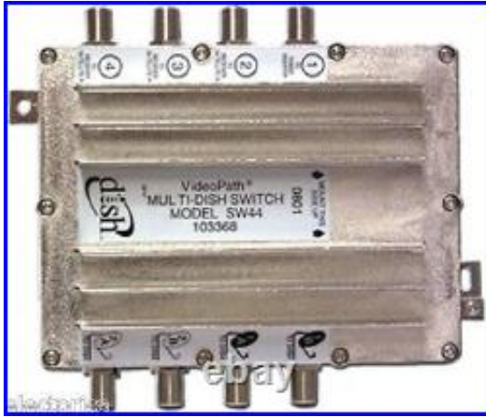
Installation Sw44 Bell Expressvu